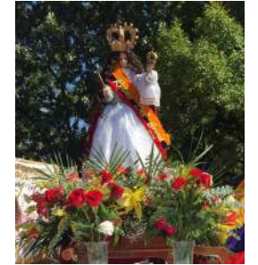
Our Lady of Cisne, Pray for Us!

412 W. 4th Street • P.O. Box 133 Carver, MN 55315 952-448-2345 952-368-0502 Fax www.stnicholascarver.org