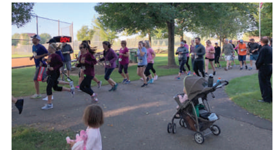
Thanks to everyone who made our Fall Festival possible!

412 W. 4th Street • P.O. Box 133 Carver, MN 55315 952-448-2345 952-368-0502 Fax www.stnicholascarver.org