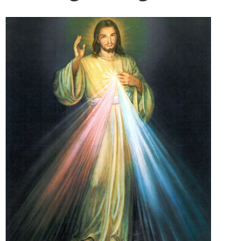
Happy Divine Mercy Sunday!

We are glad to have you here today! If you wish to register at St. Nicholas, please call the church.