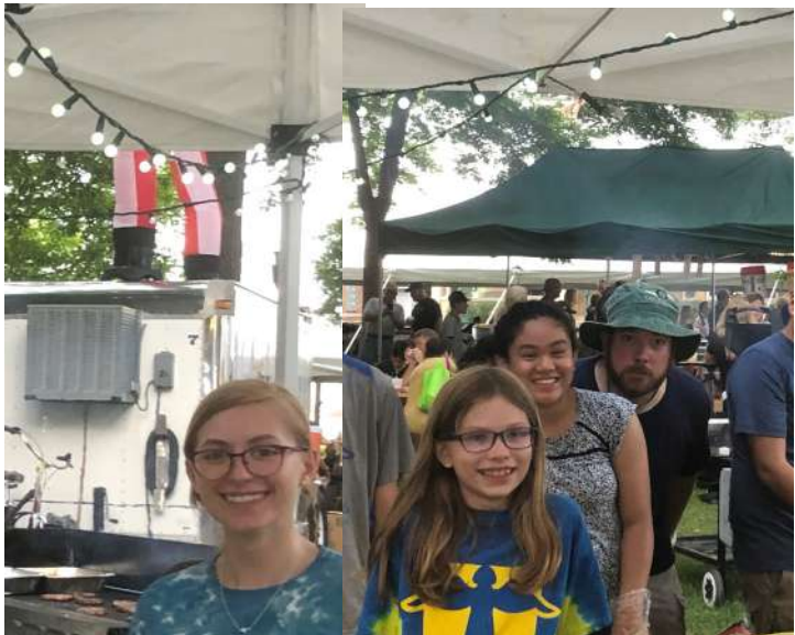
Hamburger Stand Help from last weekend's River City Days. Proceeds go to the School's Washington DC trip in Spring.